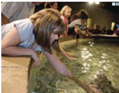
Visitors could pet leopard sharks at the Sting Ray & Shark Reef summer exhibit, sponsored by Sundance Vacations.

We served 14,013 people in individual child or parent-child classes. During our fiscal year, 22,868 schoolchildren learned about animals and science through ZSM-run programs at the Zoo or presented at schools. An additional 112,377 schoolchildren used the Zoo as a science laboratory on field trips and had ZSM curriculum available to them during self-directed tours. Programs for schoolchildren were funded in part by gifts from the Ladish Company Foundation; U.S. Cellular; A.O. Smith Foundation, Inc.; Brady Corporation; Mortgage Guaranty Insurance Corporation; Orth Charitable Lead Trust; Posner Foundation; and Badger Meter Foundation.