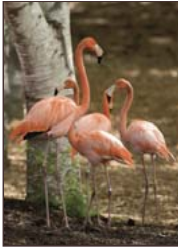
Flamingos at the Zoo. ■■