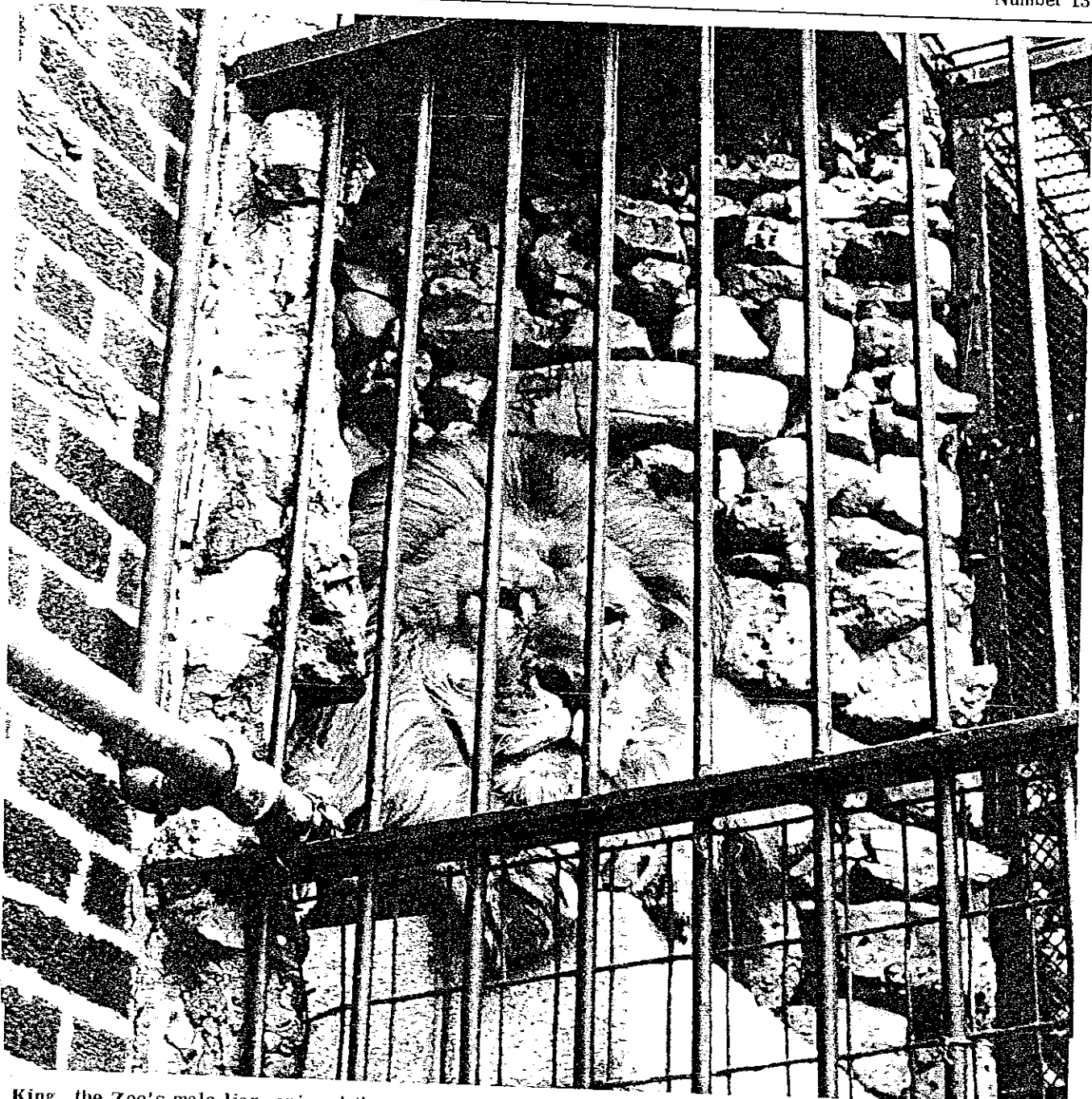
King, the Zoo's male lion, enjoyed the outdoor air long stilled over his cage. Story on page 3.