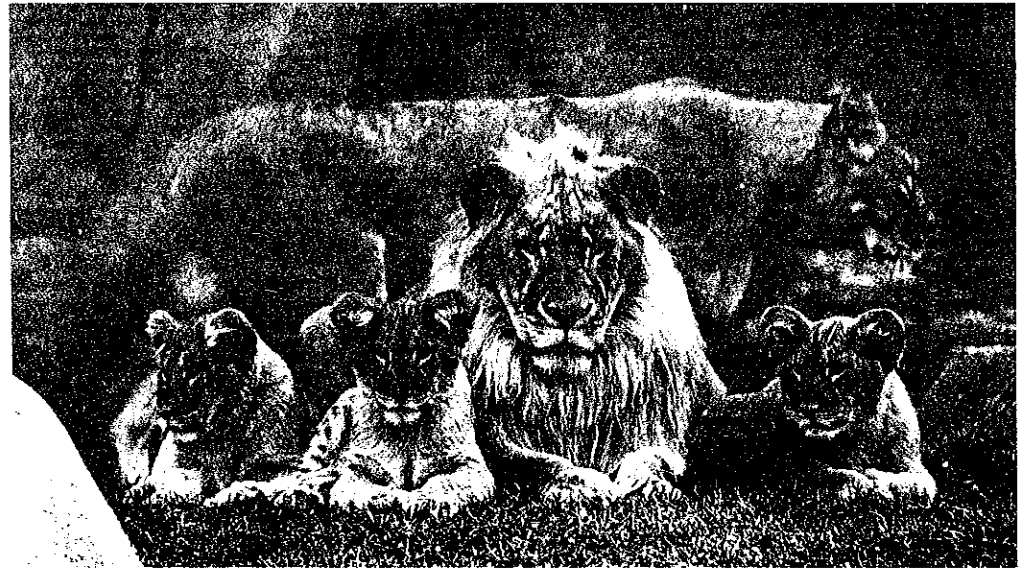
Our Lion Pride Salutes Zoo Pride