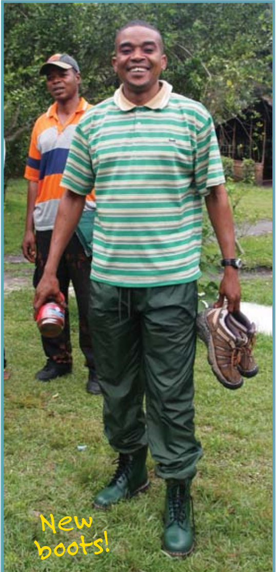
Above: Mozart is all smiles after getting new boots, a key protection against venomous snakes.

Top Right: A wild bonobo in Salonga National Park.