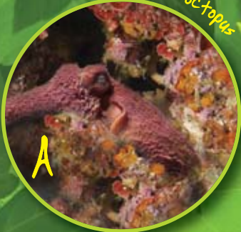
giant Pacific octopus

When you play hide-and-seek, you might scramble behind a tree or crawl under a bush where no one will see you. Animals hide in the wild, too. But they can't always find good hiding places. Instead, they hide in plain sight using camouflage. Camouflage is an animal's way of disguising itself. Look at the five animals along the top of these pages. Unscramble the letters under each picture to name the animal. How do they blend into their surroundings? Play the matching game below to discover special types of camouflage. On the next page, find out how to make your own zebra-stripe pillowcase. Then go online to zoosociety.org/kidsstuff for answers and for more camouflage-themed activities. On your next visit to the Milwaukee County Zoo, seek out the expert animal hidiers you find on these pages.