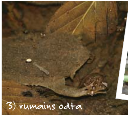
3) rurnains odtā