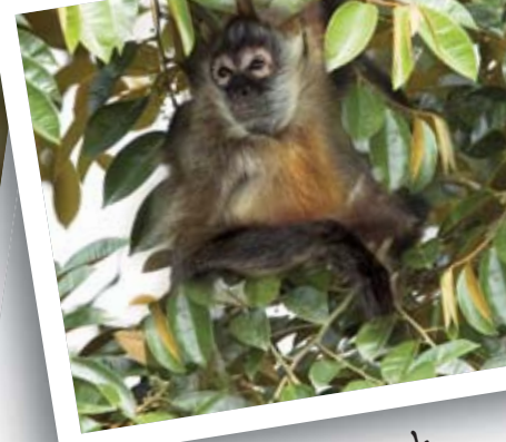
5) dripes yomnek