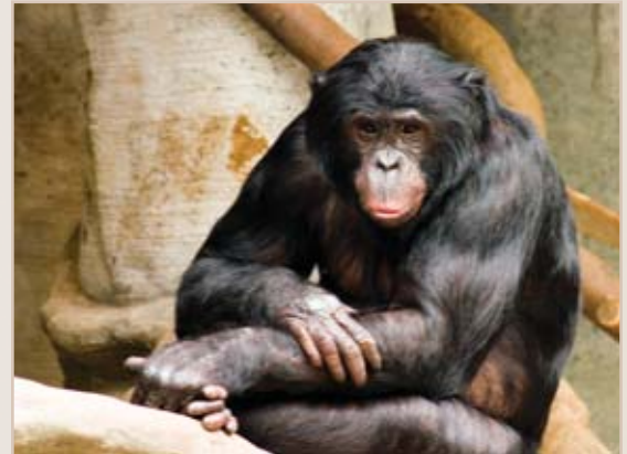
Bonobo