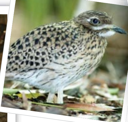
4) peca khketecin