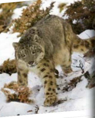
2) nwsō perlōda