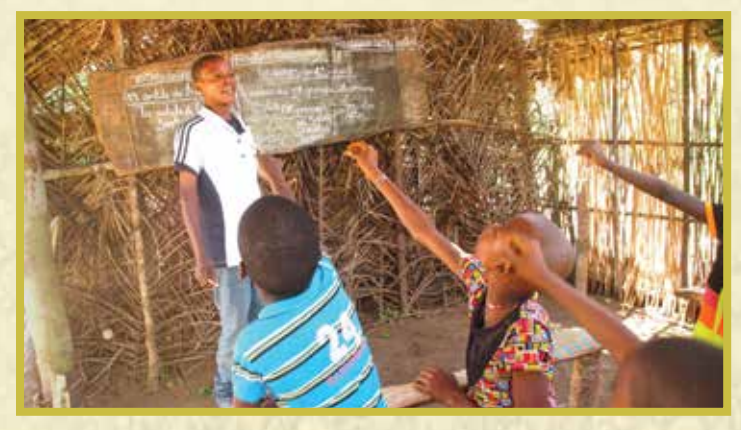
Above: BCBI donated these blackboards for the school in the village of Biondo Biondo.

Middle: The majority of children at BCBI-supported schools who finish sixth grade receive their elementary school diplomas and go on to secondary school.