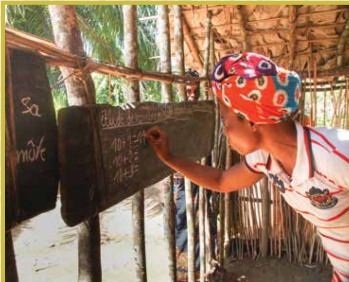
Top: BCBI donates schoolbooks to local schools around Etate.