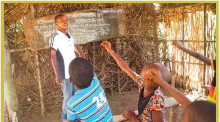
Above: BCBI donated these blackboards for the school in the village of Biondo Biondo.