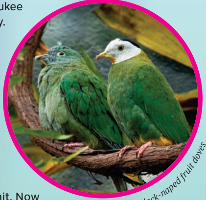
Black-naped fruit doves

You've won a trip around the world! Just come to the Milwaukee County Zoo and visit the Herb & Nada Mahler Family Aviary. Your journey begins as you approach the aviary. To the left and right you'll notice ponds where mallard ducks, geese and trumpeter swans stay year-round—birds native to Wisconsin. Now, enter the aviary. Along the walls are wooden transport crates emblazoned with Spanish words and even a sign for pasaportes —passports. You feel like you're embarking on an international journey. ¡ Vamos! —let's go! The building's birds will be your guides. First stop: the bottom of the world.