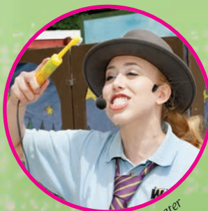
Kohl's Wild Theater

Two sessions of Zoo Pride volunteer training, level I. Call (414) 258-5667 for details.