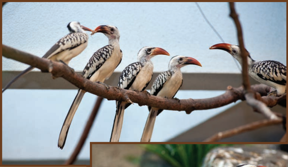
(Above) The red-billed hornbill family, minus one, last February. (Right) Snack time: a red-billed hornbill eats a cricket.