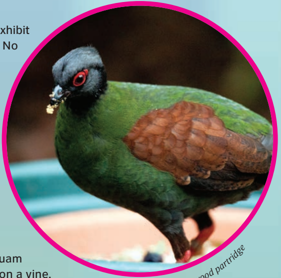
Crested wood partridge