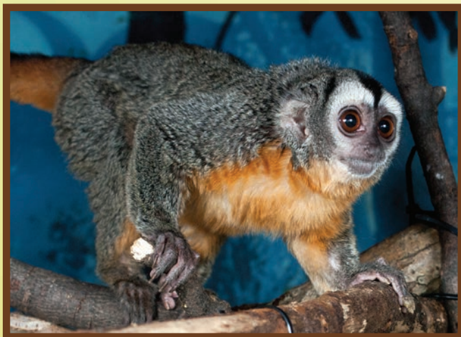
Paisa, the douroucouli.

What's the "coul"est inhabitant of the Small Mammals Building? The douroucouli, of course! This cool monkey with an auburn "vest" and a face that looks like it's made up for a night out is definitely a night animal. And it likes the swinging high life. Found in the canopy of the Amazon rainforest in Peru, Brazil, and Colombia, the douroucouli is a skilled leaper. It can jump up to 12 feet between branches. This night monkey (also known as an owl monkey) gets most active at dusk and again at dawn. The Milwaukee County Zoo welcomed