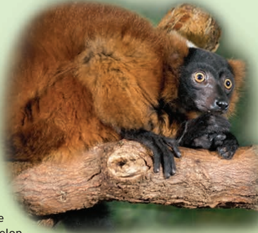
Red ruffed lemur

Endangered Species, a two-day University of Wisconsin-Milwaukee course for teachers of grades 3 through high school, will be held June 15 and 16 at the Zoo. The course explores both animal survival in the wild and how modern zoos help animals. It runs 8:30 a.m. to 4:30 p.m. daily. Included are tours, discussions and activities to help teachers develop study units. This one-credit course can be taken for graduate or undergraduate credit. Call UWM Outreach, (414) 229-5255, for fees and to register.