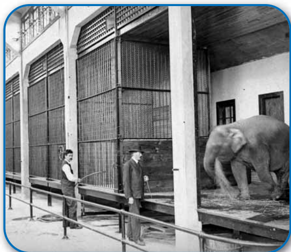
Photo: Early elephant keepers.