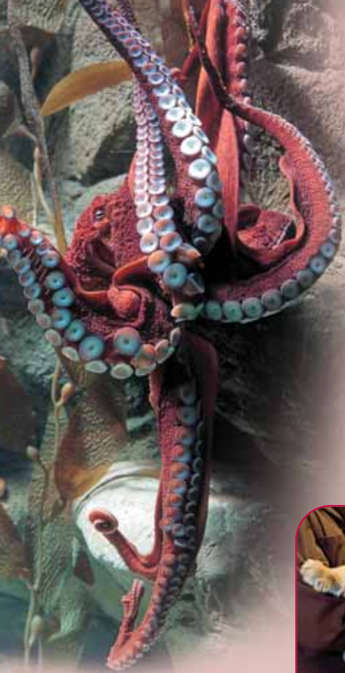
Photo: An octopus at the Zoo.