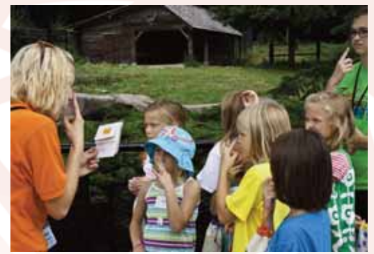
Kids in a 2010 summer camp.

More than 11,000 people attend Zoological Society Summer Camps, sponsored this year by Noodles & Company. The Summer Camps brochure was mailed along with your January issue of Alive magazine and lists all 2011 ZSM camp offerings. Members-only priority, online registration begins Feb. 10. Check the Web site for availability and online registration information: zoosociety.org/Summer