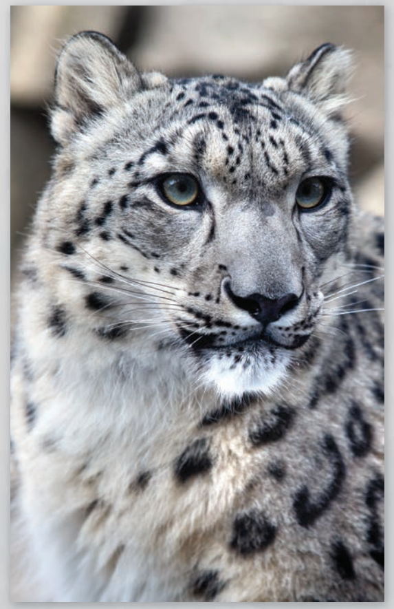
Snow leopard Asa in his new exhibit.

taking him home each night in a heated animal carrier. Snow leopards are born blind and deaf, so it was exciting when he began to see and hear at about 2 weeks old, she says. "When Asa would hear me talking or see me coming into the room, he would chirp. As time passed, these vocalizations grew louder and more prominent as he discovered the world around him. It was exciting to witness his growth and development so close up."