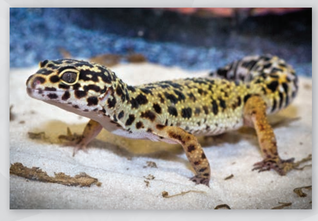
Joey, the leopard gecko, in her terrarium.

The crickets crawl and hop inside the plastic container, oblivious to the danger lurking nearby. The danger in question: a 10-inch-long female leopard gecko, one of the newest additions to the Stackner Animal Encounter building in the farm area at the Milwaukee County Zoo. Luckily for these two crickets, the leopard gecko, named Joey, is full after consuming two other crickets earlier. The two living crickets get a reprieve, for now. The ones that were consumed earlier weren't so lucky. "She strikes fast, and