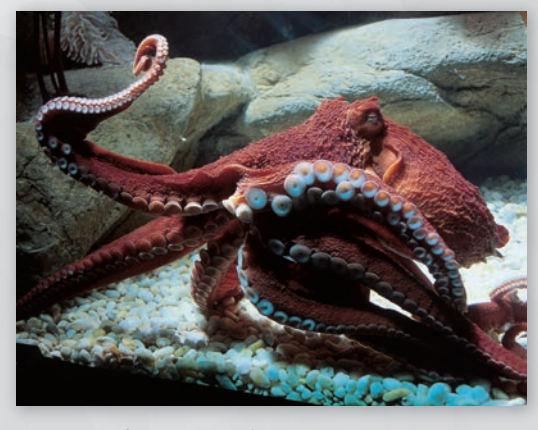
A giant Pacific octopus at the Zoo.