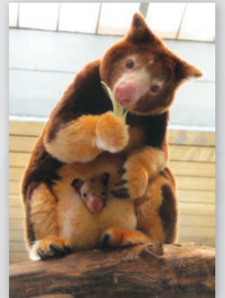
Tia, when she was a joey, pokes her head out of Kiama's pouch.