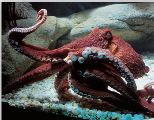
A giant Pacific octopus at the Zoo.