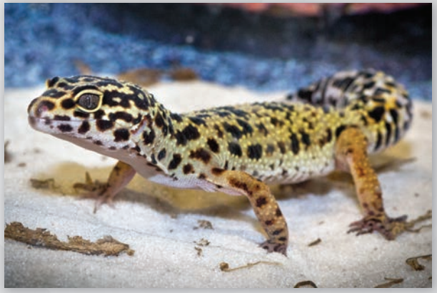
Joey, the leopard gecko, in her terrarium.