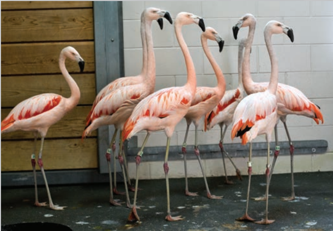
Newly arrived Chilean flamingos at the Zoo.

different, meaning they have different traits, so they will be easily recognized as different from the Caribbean flamingos."