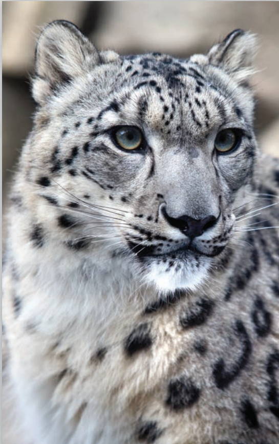
Snow leopard Asa in his new exhibit.