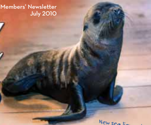
New sea lion pup! see page 15