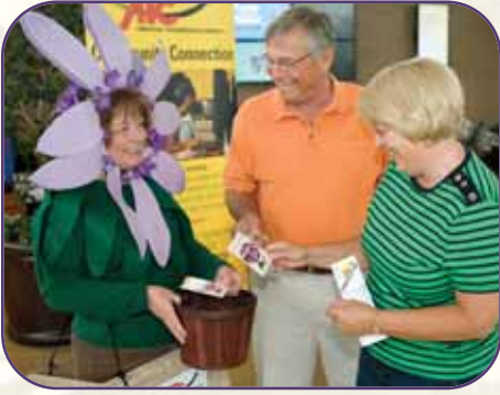
Photo: It's purple daisy time as American Transmission