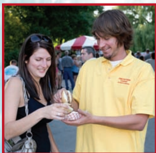
Friends joke in between dinner bites at last year's event.

Eat an appetizer near alpacas, have a main course close to a horse, or eat dessert near Dall sheep. At this popular Milwaukee County Zoo festival, you can purchase food from a variety of Milwaukee-area restaurants and food vendors. And because it's the Zoo, you can visit your favorite animals while you eat! There's also music! A musical highlight, among the many bands on six stages, is the national act Los Lonely Boys on Aug. 17 at 8 p.m. at the Caribou Stage, sponsored by MillerCoors. The entire park and all animal buildings will be open at night (the Mahler Family Aviary closes at dusk). Food vendors include Café El Sol, Whole Foods Market, Robert's Frozen Custard, Trinity Three Irish Pubs, and more. Remember to cast your vote for your favorite restaurant through U.S. Cellular®'s Fan Favorite Text Vote (must be at least 18 to vote).