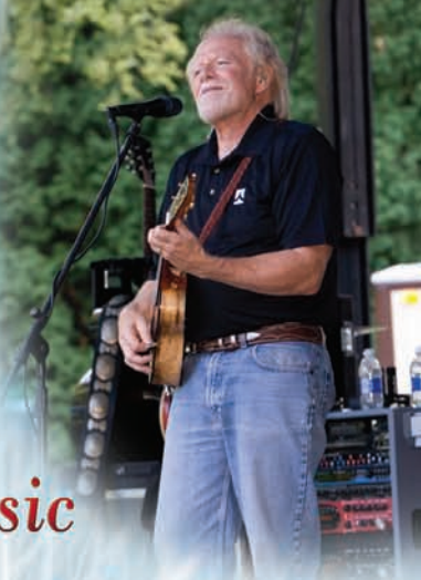
a la Carte

Free Zoo admission for Zoological Society members with ID. For others: adults, $14.25; ages 3-12, $11.25; ages 2 & under, free; ages 60 and older, $13.25. Value (multi-day) tickets ($26 adults; $18 children) available for purchase through Aug. 19 at Tri City National Bank locations. Milwaukee County parking fee: $12 (Zoo Pass Plus members receive free parking). For details, call (414) 256-5466 or go to: www.milwaukeezoo.org