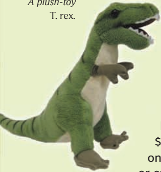
A plush-toy T. rex .

Most kids are fascinated with dinosaurs. Add to their interest with a sponsorship of a visiting robotic dino at the Zoo: a T. rex or Chasmosaurus . Sponsorship includes a plush-toy T. rex or Chasmosaurus (choose one), a colorful fact sheet about dinosaurs, one free admission ticket to Adventure Dinosaur!, sponsored by Sendik's Food Markets, an invitation to the Aug. 25 behind-the-scenes event for animal sponsors at the Zoo, sponsor recognition on our "All in the Family" donor board for a year and a Sponsor an Animal decal. Sponsorship is only $20 plus $5 for shipping and handling. Offer ends Sept. 3, 2012. Order online at zoosociety.org/LTO and click on the plush-toy dinosaur picture or call 414-258-2333.