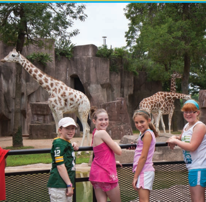
Children in summer camps get to visit animals they study, such as giraffes.