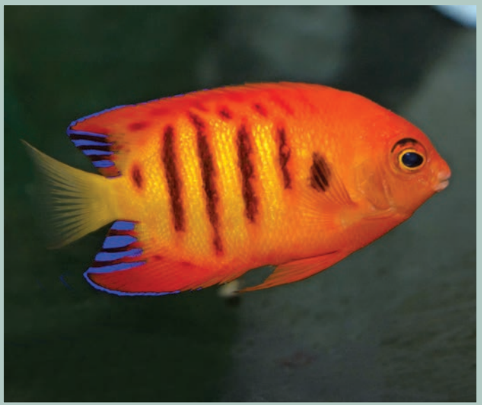
Flame angelfish

Flame angelfish are found in reefs surrounding tropical islands in the Pacific Ocean. They grow to about 4 inches in length and are popular among aquarium enthusiasts due to their brilliant color and relative ease of care. In the wild they feed on algae and small crustaceans. When they feel threatened they hide in the coral for protection. Canarytops — also known as sand-reef wrasses, lemon meringue wrasses and white-bellied wrasses — are widespread in reefs in the Indian Ocean. They also feed on algae and small crustaceans. Canarytops grow to 5 inches in length and are often seen by divers because they cruise just above the surface of the coral as they search for food.