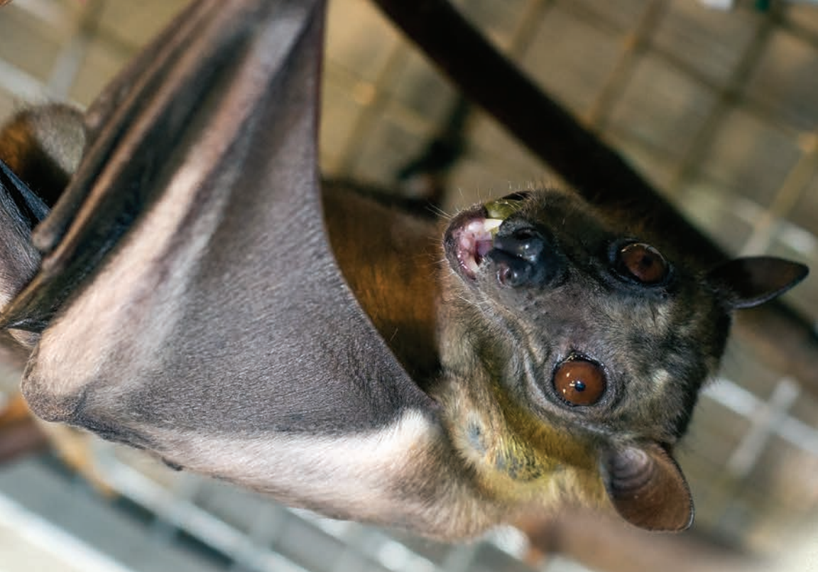
Apollo literally hangs out in the kitchen of the Small Mammals Building, where he resides.