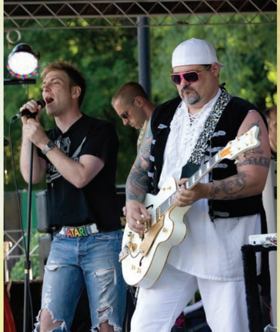
A band rocks out at a previous event.

Tri City National Bank customers: Get a free ride on the Penzeys Spices Carousel. Stop in at any branch and get a free ride ticket while supplies last. (Valid June 24, July 1, 8, 15, 22, and 29, 2015, only during evening Sunset Zoofaris. Does not include Zoo admission or parking. One ticket per person per bank visit.) Visit tcnb.com for bank locations.