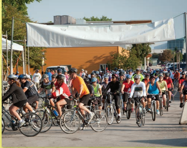
And they're off: Bikers start their ride through the Zoo park and beyond.

Register online at zoosociety.org/Bike by Sept. 9 or call 414-258-2333 for a brochure. Day-of-event registrations accepted, but T-shirt sizes aren't guaranteed. Costs for Zoo Pass members: adults (ages 14 and over), $35; children (ages 3-13), $12; family of four, $85. Non-members: adults, $40; children, $15; family of four, $100. Day of: adults, $45; children, $20.