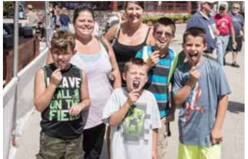
Who doesn't enjoy a dessert?