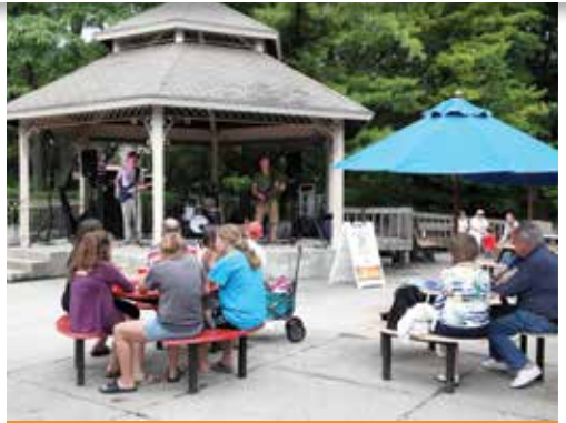
Sunset Zoofari guests enjoy dinner and a live band.

Every week, you and the family can come to the Zoo after hours to listen to music and watch a movie outdoors. You can bring a picnic dinner or buy food from one of the Zoo's restaurants (to read more about new food options this summer turn to page 8). Bands will perform on the Flamingo Patio, and kid-friendly movies will start at dusk near the caribou. Feel free to get up, walk around the Zoo or check out the summer exhibit, Dinosaurs! A Jurassic Journey, sponsored by Sendik's Food Markets. Animals, nature and music make Sunset Zoofari the perfect summer evening activity.