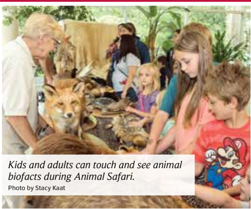
Kids and adults can touch and see animal biofacts during Animal Safari.