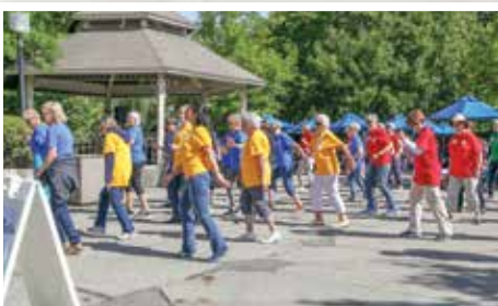
Line dancing always draws a crowd.