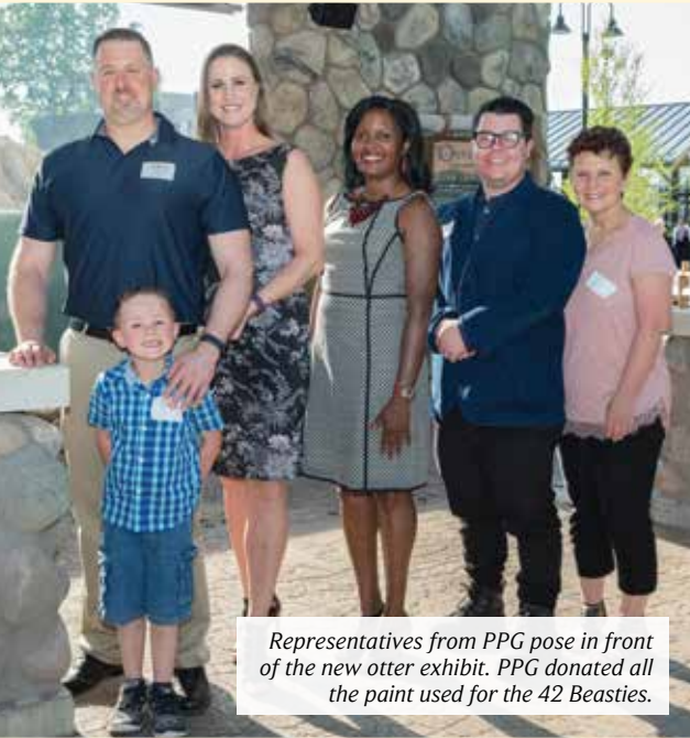
Representatives from PPG pose in front of the new otter exhibit. PPG donated all the paint used for the 42 Beasties.