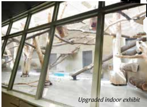
Upgraded indoor exhibit