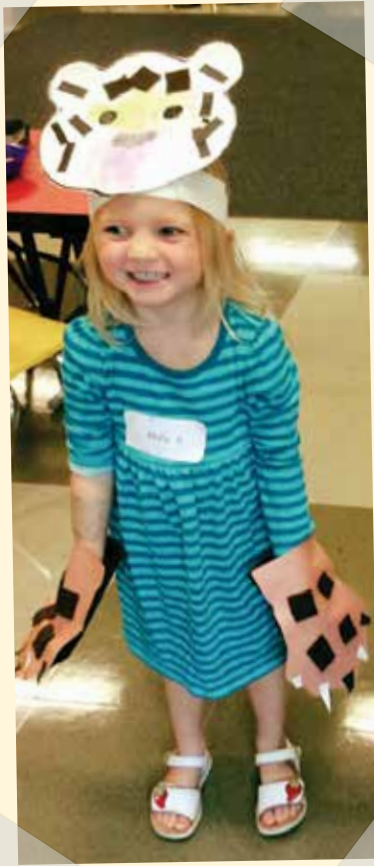
Holly creates a bear costume and learns about bear behaviors.

Special Note: Due to changes in our database system, it is recommended you create an account or check your existing account before registration opens. Having your account ready will save you time in the long run.