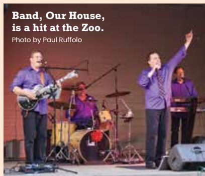
Band, Our House, is a hit at the Zoo.

Food will be available for purchase at the Zoo’s restaurants throughout the grounds.