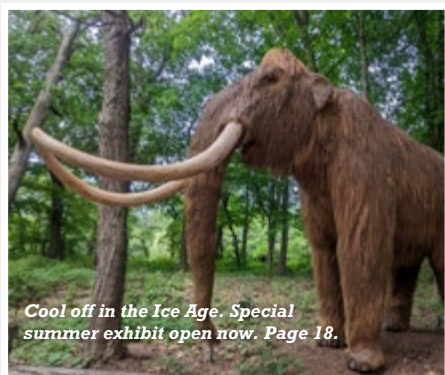
Cool off in the Ice Age. Special summer exhibit open now. Page 18.