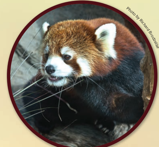
Dash enjoys a cool fall day.

Special areas for enrichment activities and food treats to keep the pandas' minds active