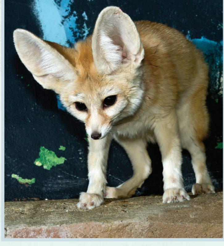
Something on the ground catches Ariel's attention.

Ariel's pep is due not only to her age. In the wild, fennec foxes have to scurry in a hurry.