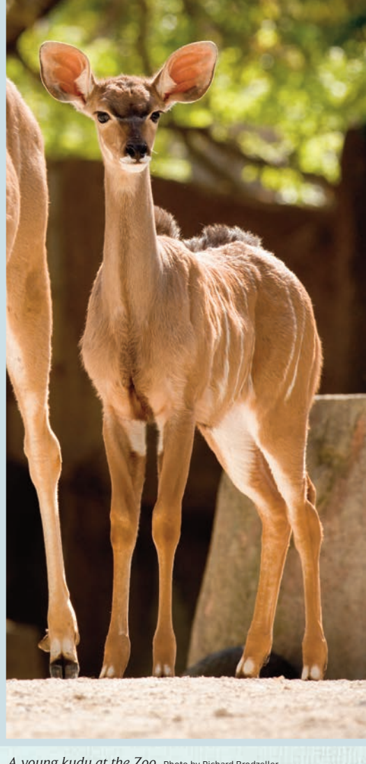
A young kudu at the Zoo.

With the addition of Rocco and Gordon — named after celebrity chefs Rocco DiSpirito and Gordon Ramsay — the Zoo's kudu herd numbers eight. In the wild, males can weigh up to 600 pounds. They're mostly solitary, but during mating season they typically join groups of females, which usually number three to 10. Greater kudus are found throughout Eastern and Southern Africa and prefer to live in wooded areas. They're not threatened, but in some areas populations are thin because their habitat is being converted to farmland. Besides predation from big cats, hyenas and wild dogs, male kudus are hunted for their