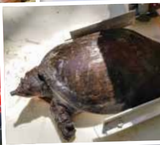
Turtle photos provided by Collette Konkell

Donations of $100 or greater will be recognized on a digital sign within Adventure Africa.