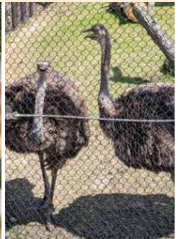
The ostriches are often found hanging out in the corner or along the fence line.