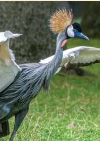
The grey crowned cranes will occasionally peck at the impalas.

While keepers make sure none of the animals get hurt, Dowgwillo explains that giving the animals a more natural experience in a mixed-species yard means exposing them to different aspects of life. “For the animals, it's good for them. It lets everyone be able to exhibit species-appropriate behaviors and it lets them have positive experiences and some negative experiences, which gives them a more enriched, full life.”