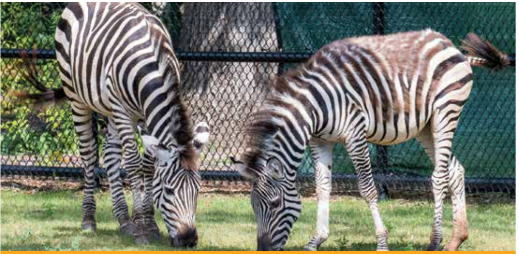
Male zebras Pacco and Stuart “run the show.”