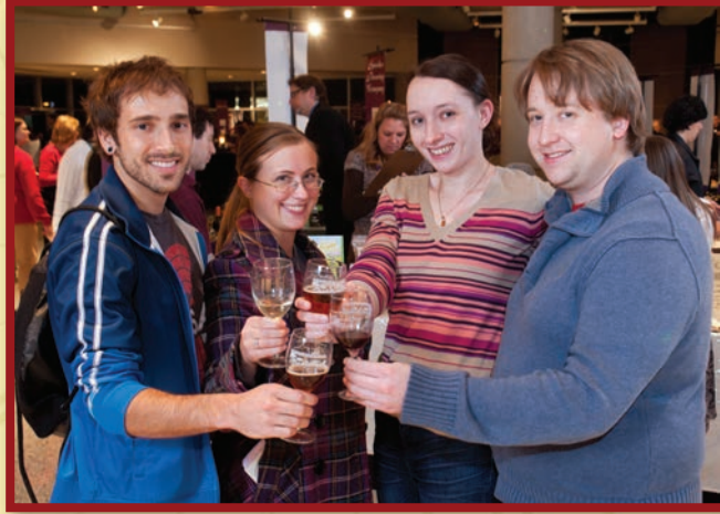
"To the animals!" Friends clink glasses at last year's event.

*ZSM members' guests must register at same time as members. **VIP ticket holders get early entry at 6 p.m. and are entered into a drawing to win a behind-the-scenes tour of the Zoo. Your fee, less $25, is tax-deductible and includes a complimentary, etched wine glass (5.6% WI sales tax included). You must pre-register and you should do so early—event usually sells out. All ticket sales are final and are not refundable.