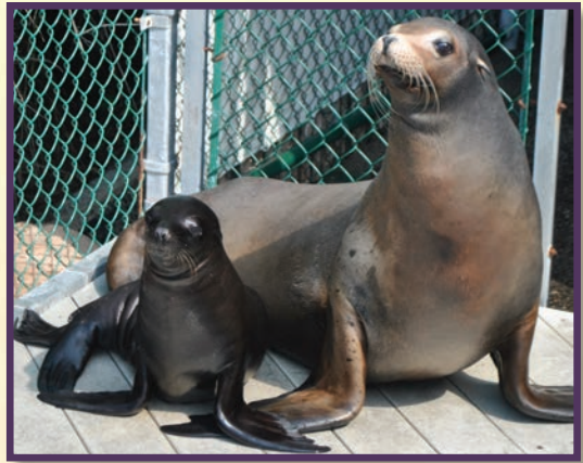
Colby and his mom, Makaia