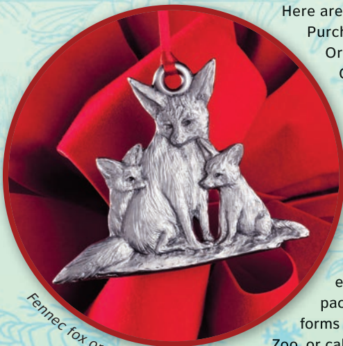
Fennec fox ornament

Or give a Zoo Pass to your favorite family or friend. The Zoological Society is a great source for animal-themed holiday gifts. For kids, there's a membership in our eco-themed Kids Conservation Club. Anyone who loves the Zoo will benefit from a Zoo Pass or Zoo Pass Plus (with parking) membership. You can use them at the Milwaukee County Zoo or at more than 150 other zoos or aquariums for free or discounted admission. This year we're again offering gift certificates, which can be redeemed for special events, for Zoological Society education classes or camps, or for a Sponsor an Animal package. To purchase, see www.zoosociety.org , send in the forms in this issue, stop in the Zoological Society office in the Zoo, or call (414) 258-2333. Here are your gift options: