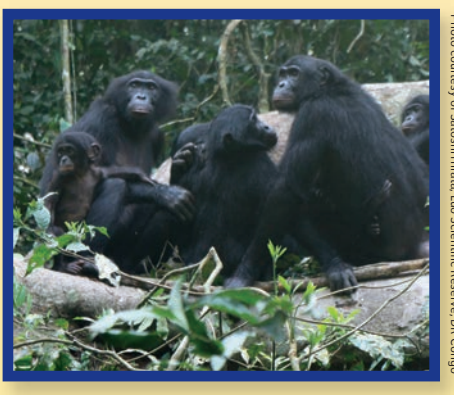
A group of wild bonobos.

Imagine what it's like to work in the Salonga National Park in the Democratic Republic of Congo, one of the remotest places on Earth. Your "office" is a hot, humid rainforest. Insects buzz and bite. Something in the forest canopy rustles. Was that a bonobo? Maybe, but the field survey must continue apace: cutting trails, taking GPS waypoints, recording observations of wildlife and forest characteristics, as well as signs of human activity. Those tasks are just a part of the critical work performed by staff of the Bonobo & Congo Biodiversity Initiative (BCBI), the Zoological Society of Milwaukee's premier, award-winning conservation program. If you've always wanted to learn more about BCBI's wide range of operations,