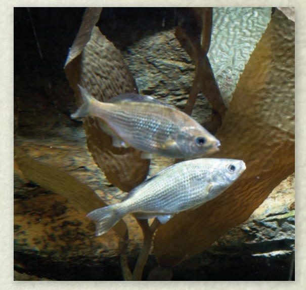
Two shiner perch in the Puget Sound exhibit