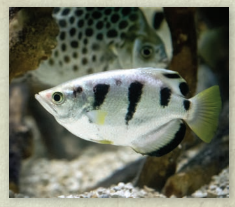
An archer fish at the Milwaukee County Zoo

You're an insect perched on a branch, going about your insect business. You scan your surroundings, always on the lookout for predators. What you don't see is a powerful blast of water rushing at you from below. You're knocked off balance and fall into the water. You struggle but in seconds you're gobbled up by an archer fish. Archer fishes, which live in brackish mangrove swamps in some coastal areas of India and Southeast Asia, are one of the few fishes in the world that hunt in this manner. In July 2014, the Milwaukee County Zoo acquired three archer fishes, but they were very small at the time. Now they are easy to see in the Mangrove Exhibit in the Aquatic & Reptile Center (ARC). If you're lucky you can watch them