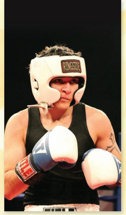
An amateur boxer steps up to his opponent at last year's event.