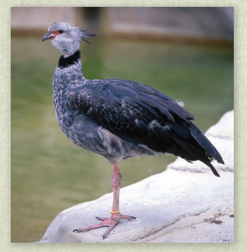
A crested screamer at the Milwaukee County Zoo

Crested screamers are birds with some interesting adaptations. One of the first things you may notice about the Milwaukee County Zoo's two crested screamers is their feet. They look like formidable weapons, as if each digit could be used for ripping flesh. But in fact they're designed to navigate swampy, marshy habitats in their native Bolivia, southern Brazil and northern Argentina. They use their long, unwebbed toes to grasp vegetation. Despite being about the size of a turkey, extensive hollow spaces in their bones make them light, so they can also walk on dense mats of floating plants. Another interesting adaptation is the large, bony spurs on the inner side of each wing, used to defend territory and for self-defense.