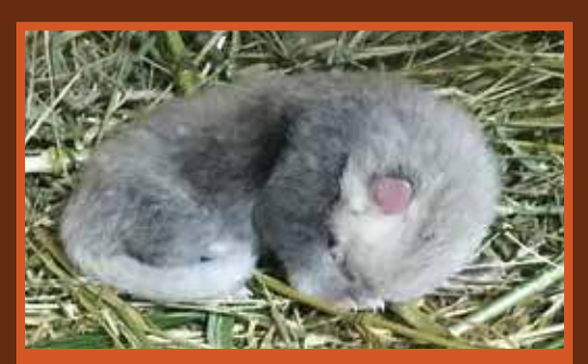
Red panda cubs are born a greyish color and start to develop their adult fur when they are close to 2 months old.

This is a perfect time of year to visit the red pandas since they prefer the cooler weather. Compared to her parents, Kiki is smaller in size, but that will change before you know it.