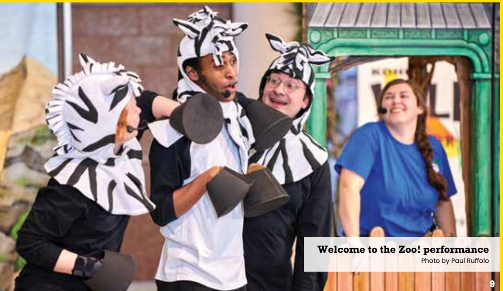
Welcome to the Zoo! performance

Schools or organizations need to register for a performance at wildtheater.org .