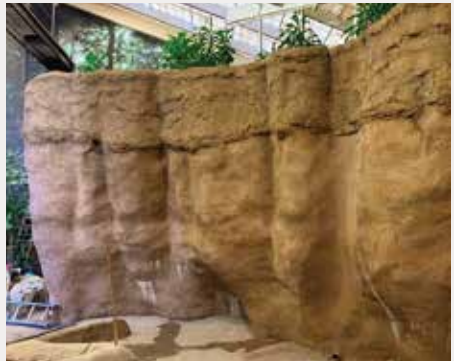
Contractors added three feet to the wall.

The Zoo currently has two male gorillas, Maji and Hodari. It is hoping to get a new family of gorillas in the future.