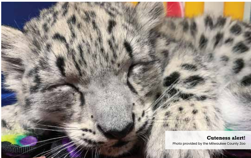
Cuteness alert!

This holiday season, celebrate a different kind of snow – a snow leopard. Female snow leopard Milja was born in May, and this winter you can sponsor her.