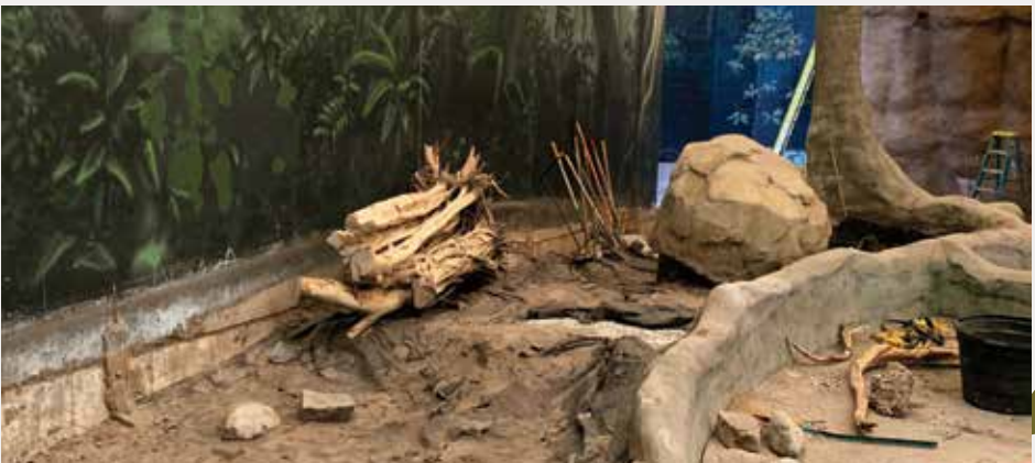
The planter area was removed to give the gorillas more space to move around.