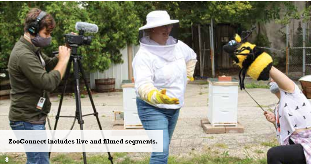
ZooConnect includes live and filmed segments.

The Education Department continues to add experiences. For the most up-to-date offerings, go to our website, zoosociety.org/education .