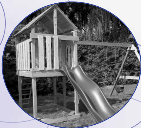
Backyard play set