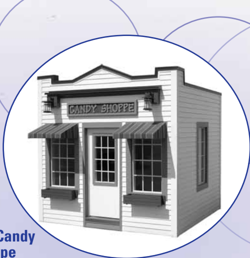
The Candy Shoppe

The ZSM will transport the playhouses or the play set to each winner's desired location (within 25 miles of the Zoo) at no cost within six weeks of the drawing. The Candy Shoppe playhouse was built and donated by Building Service, Inc.; Country Prairie Cottage was built by Southeast Wisconsin Carpentry Training Center, with materials provided by Carpenters & Floor Coverers Local No. 334; the play set was donated by Backyard Playsets LLC.