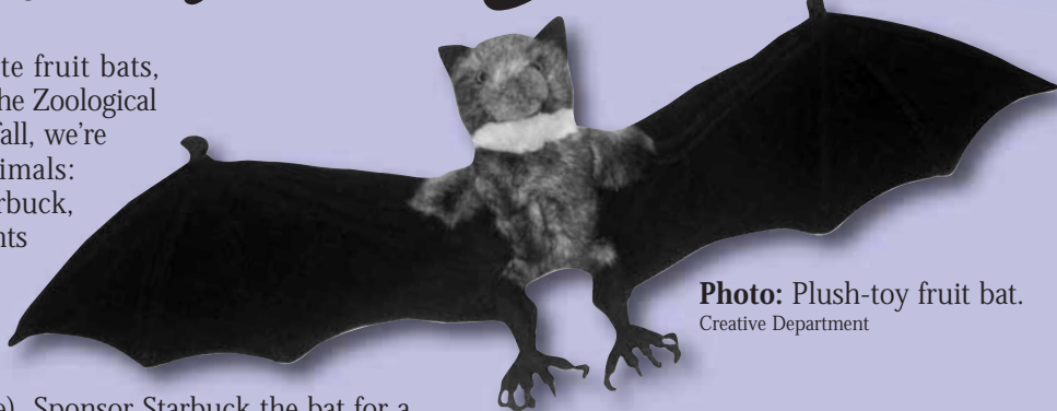
Photo: Plush-toy fruit bat.

Both the bat package and the gorilla package (which is always $30) include a plush-toy bat or gorilla; animal information; a certificate of sponsorship, an invitation to the Aug. 29 Animal Safari or to next year's event; sponsor recognition on a donor board for a year; and a Sponsor an Animal decal. The gorilla offer ends Sept. 30; the bat offer goes through November, perfect for a Halloween "treat." The Zoological Society's Sponsor an Animal program helps support all the animals at the Zoo. To order, go online at www.zoosociety.org or call our office at (414) 258-2333.