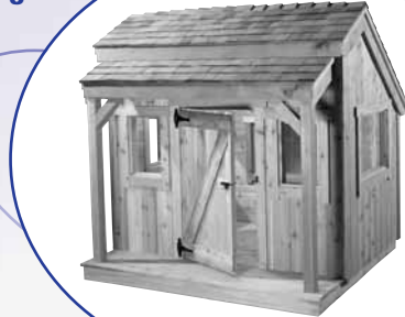
Country Prairie Cottage