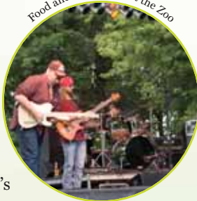
Food and Music Fest at the Zoo

Milwaukee Journal Sentinel a la Carte at the Zoo (Zoo open in the evening)*