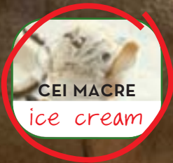
CEI MACRE ice cream